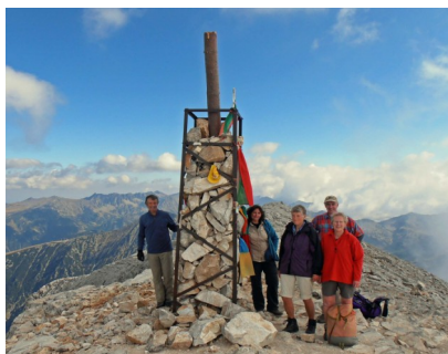
On a Bulgarian mountain top

Four members of the Perth U3A Hill-walking Group have spent a most enjoyable week in SW Bulgaria, near the ski resort of Bansko, walking in and near the Pirin National Park. They were very fortunate to be the only guests in the hotel, it being the last week of the summer" season. The opportunity had arisen because the very hospitable English couple running the hotel had already entertained another U3A group and had realised that U3A folk were a good target market. Bulgaria, its mountains and culture lived up to all expectations and gave a fascinating view of one of the less well-known parts of Europe. Many thanks to Cris Bonomy who did all the organising. Ian Tait